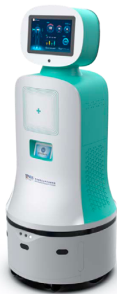
SENSORI AMR Auto Measurement Robot