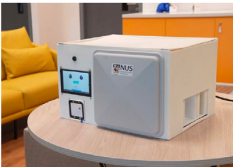
SENSORI XCube Self-service Desktop Box

In hospitals and nursing homes, nurses spend too much time in vital signs monitoring due to the limitation of conventional monitoring devices. Sensori Healthcare's vital signs monitoring system - Sensori VSM, is a cost effective device that can measure 5 critical vital signs (blood pressure, blood oxygen saturation, pulse rate, respiration rate, and temperature) simultaneously via non-contact sensors quickly. Sensori VSM can be deployed on different platforms to fulfill demands of various application scenarios, providing fast, comfortable, and convenient care for patients and elder people.